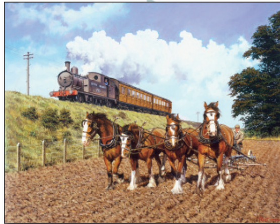
Old Workhorses, painted 2004