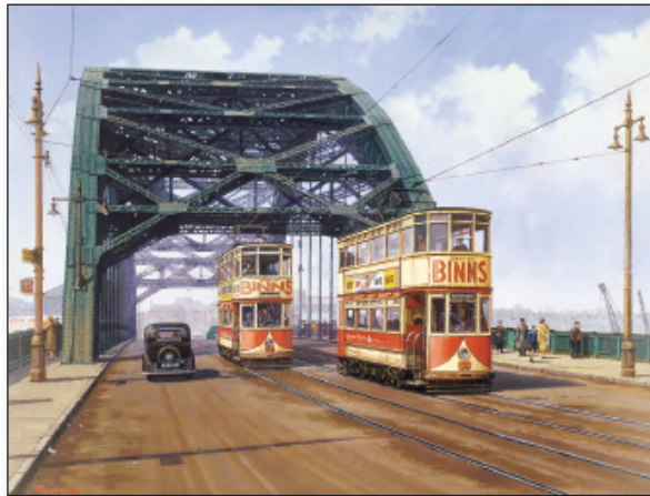
Sunderland Trams, painted 2004