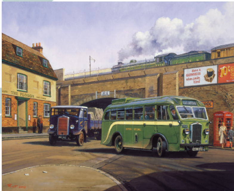
Road Versus Rail, painted 2003